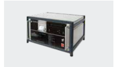
Filter Test Center (FTC)