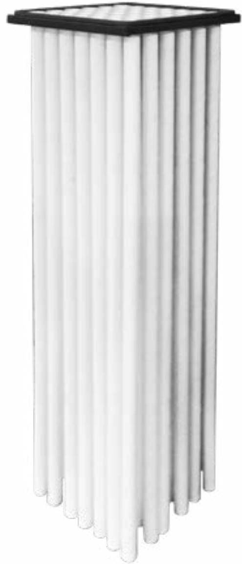
HELIX TUBE cassette